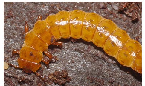
AN INSECT LARVAE