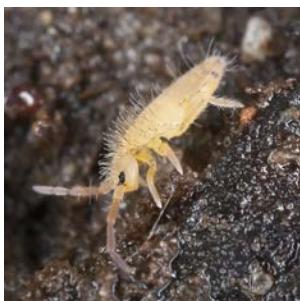
SPRINGTAILS (VERY SMALL!)