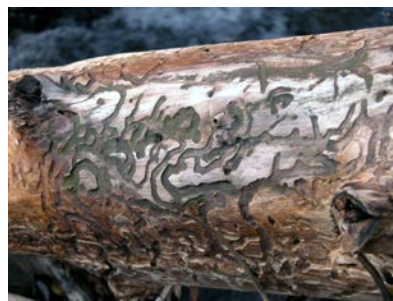
BARK BEETLE PATHS