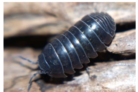
A ROLY POLY/ PILL BUG