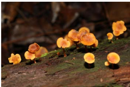
A FUNGUS ON A DEAD LOG