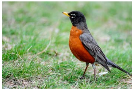
A SONG BIRD