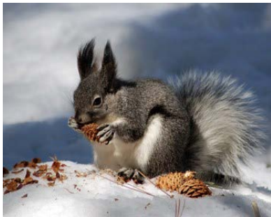
AN ANIMAL EATING