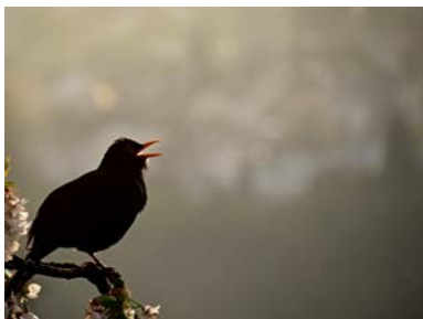
AN ANIMAL CALLING OR MAKING NOISE