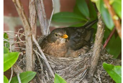
SOMETHING AN ANIMAL BUILT